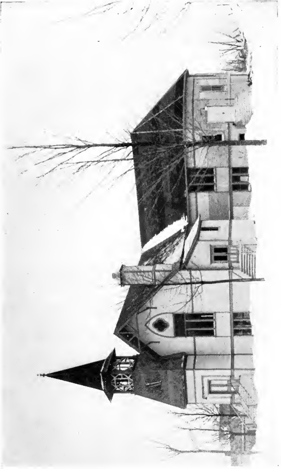
THE BENZONIA CHURCH